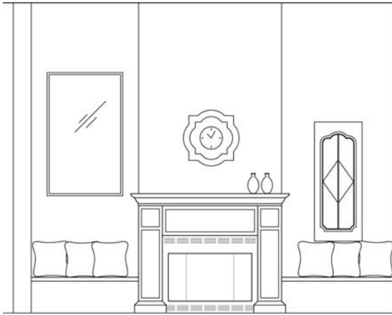
④ OUTDOOR FIREPLACE ELEVATION SCALE: 3/8" = 1'-0"

This space was featured in the Spring 2008 issue of Tucson HOME magazine.